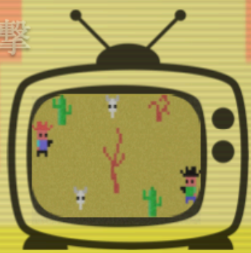
Actual InGame Footage